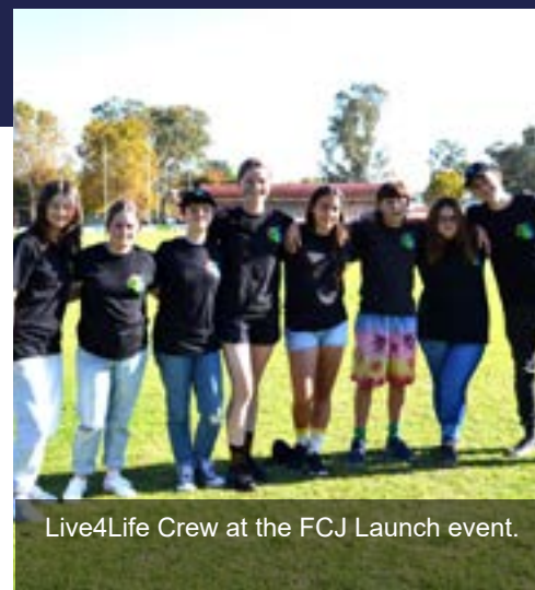
Live4Life Crew at the FCJ Launch event.