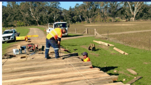
Bridge repair works at Evans Road, Tatong