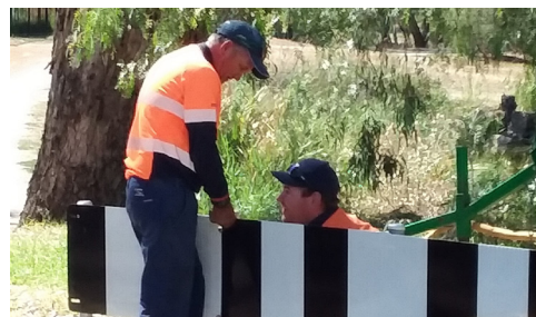
Traffic management for Anzac Day