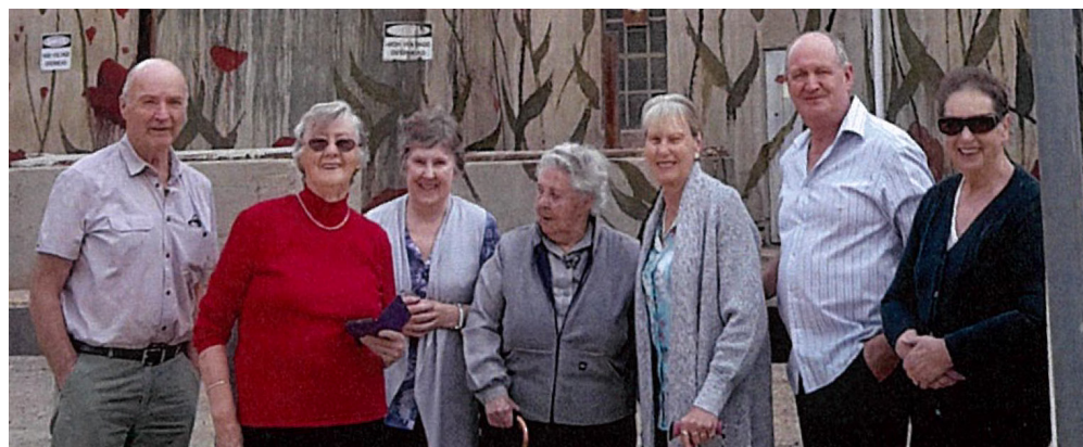
The Social Support Activity Program recently visited Devenish to see the silo art.

Contact the Council's Customer Service Centre for more information on 03 5760 2600.