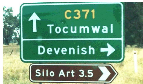
New tourism signs installed for silo art