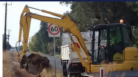
Cleaning table drains - Olivers Road, Benalla