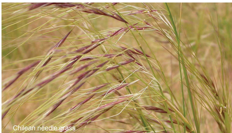
Chilean needle grass