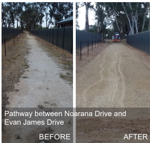
Pathway between Noarana Drive and Evan James Drive