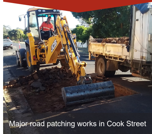
Major road patching works in Cook Street