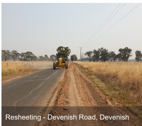
Resheeting - Devenish Road, Devenish