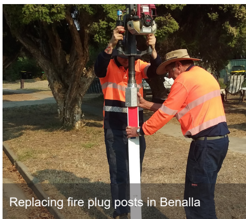
Replacing fire plug posts in Benalla