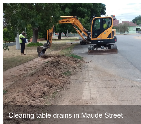
Clearing table drains in Maude Street