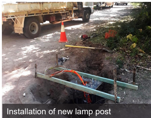
Installation of new lamp post

Drainage and resurfacing works have been completed on the walking tracks, LED lights have replaced the old lamp posts and we have installed 50 metres of steel garden bed edging.