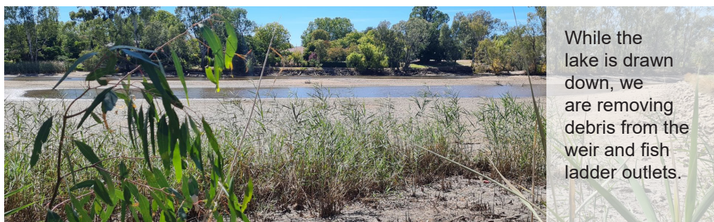
While the lake is drawn down, we are removing debris from the weir and fish ladder outlets.