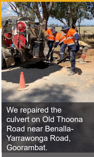
We repaired the culvert on Old Thoona Road near Benalla-Yarrawonga Road, Goorambat.