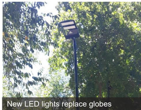
New LED lights replace globes