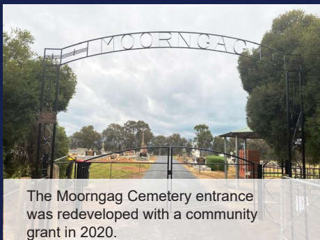
The Moornag Cemetery entrance was redeveloped with a community grant in 2020.

Applications to the Council's Community Grants Program close Friday 26 March 2021. For further information go to benalla.vic.gov.au