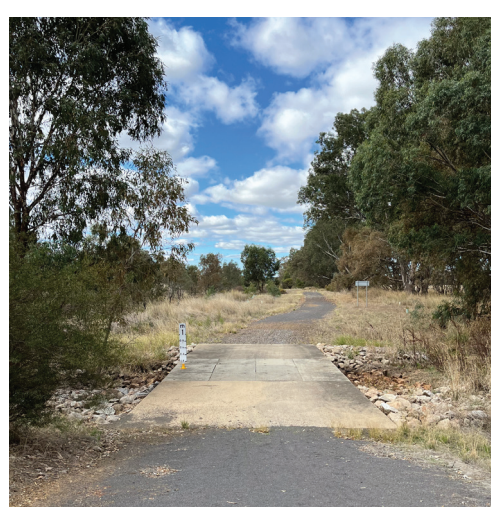
Mokoan Discovery Trail.

Council is set to begin community engagement on the Holland Bio Link Management Plan starting with adjoining landholders this month, before extending the opportunity to provide input to the wider community.