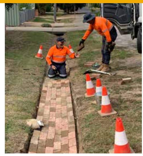
We rehabilitated the heritage gutters in Byrne Street, Benalla.