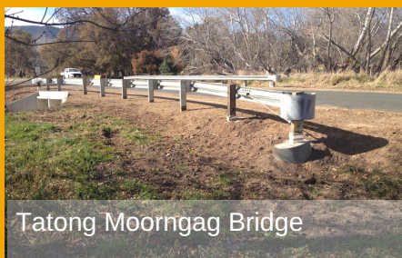
Tatong Moorngag Bridge