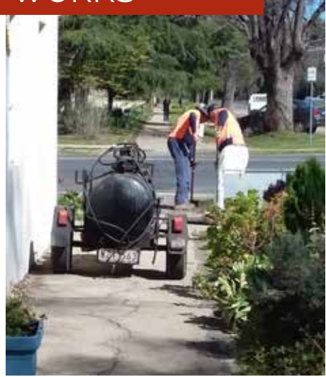
Footpath resealing works were completed on Benalla Street, Benalla.