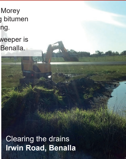
Clearing the drains Irwin Road, Benalla

Around Boweya, we've graded James Road, Leitch Road, Parker Road, Glenrowan-Boweya Road and Thoona-Boweya Road.