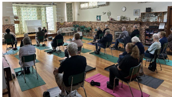
Seniors Festival events at the Benalla Aviation Museum and Chair Yoga at the CWA Hall.

Community feedback was overwhelmingly positive, with participants describing the festival as ‘fabulous, fun, affordable, and thoroughly enjoyable’. Many valued the social connections and opportunities to try new activities. The Victorian Seniors Festival organisers praised the event’s scale, variety, branding, and detailed evaluation, calling it ‘an incredible month for your residents’.